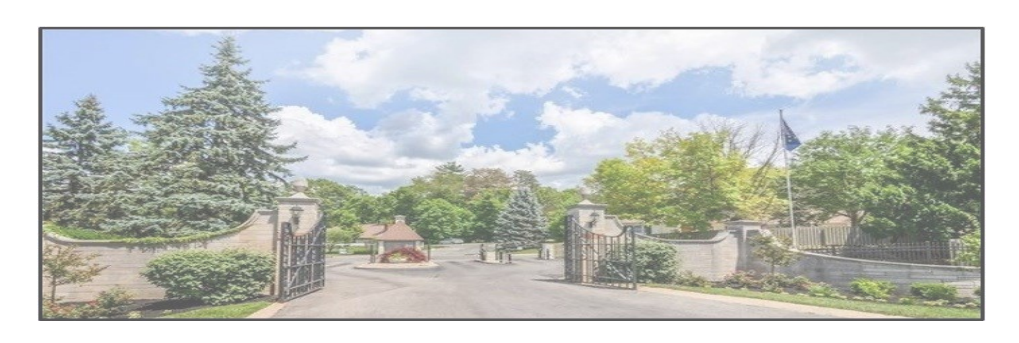
Welcome To Your Quarterly Windridge Newsletter January, 2022

A new year is an exciting time. It's the start of new beginnings, fresh ideas, and moving forward. Sometimes it's just the anticipation of totally starting over. We think everyone will agree it's a relief to have 2021 in the rear-view mirror with hopes of a much better 2022.